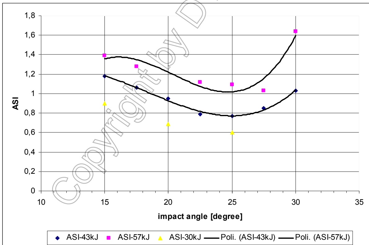
Figure 2: Acceleration Severity Index (ASI) varying impact conditions