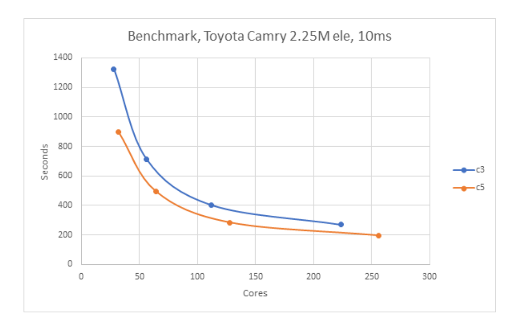
Fig.2: Benchmark representation on C3 nodes (Intel E5-2680v4) and C5 nodes (Intel Gold 6242).

Users must note that there is always a price driver on the decision making, so price-performance is one of the measuring units when evaluating a certain option.