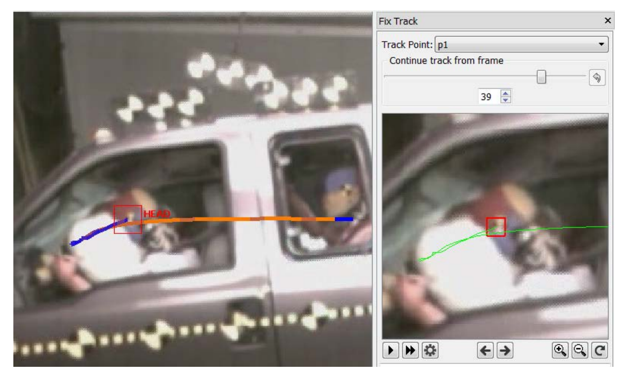
Fig.4: Manual fix of tracking point trajectory

For cases that the display of tracked point is lost behind a feature, while the video is replayed, it is possible to fix manually the point trajectory tracked by META. There is a tool dedicated to performing this action by the user frame-by-frame, with a detailed view of the area of interest: