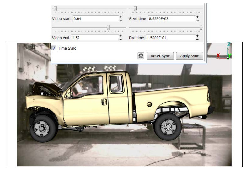
Fig.2: Model states synchronized with video frames

The number of states of the simulation model has to be synchronized with the corresponding video frames. The user selects the range of states and frames and META linearly interpolates the animation steps to synchronize the model movement with the video frames: