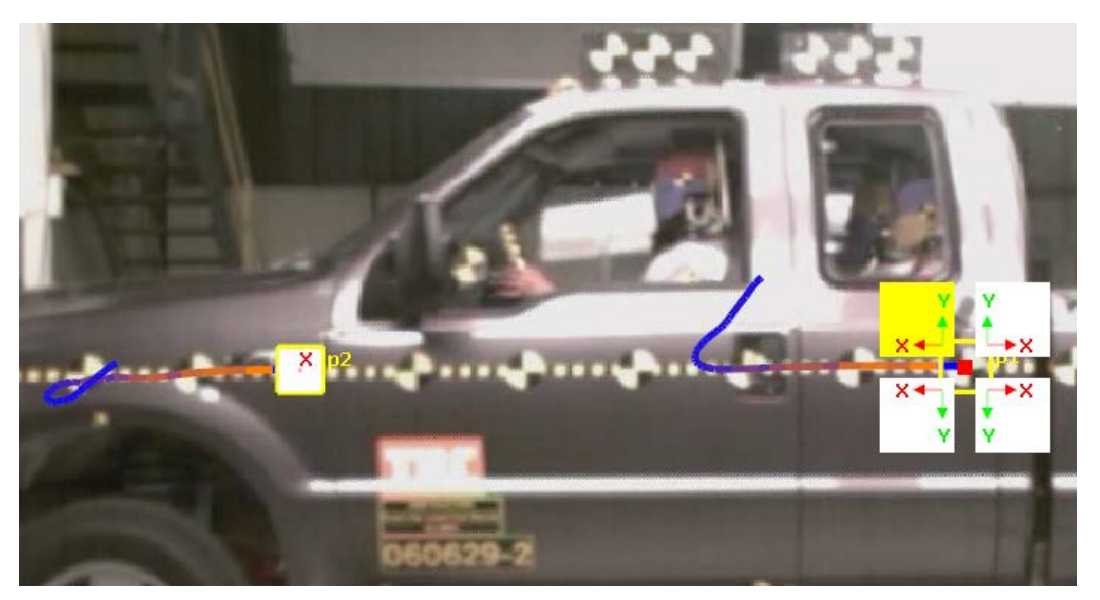
Fig.5: Creation of local dynamic frame

Another case of tracking points of interest on test videos is to transform tracked results on a local coordinate system/frame, static or dynamic. In this case the motion will be transformed on an axis based on two points of the video's moving object: