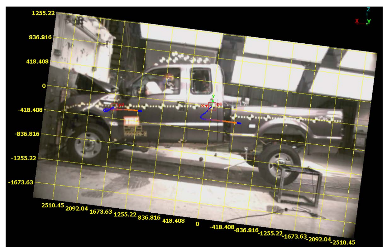
Fig.6: Playing back of video in relation to dynamic coordinate system

Playing back the video, the moving object is in-line with the axis of the two selected points, while the video is rotated accordingly: