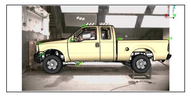
Fig.1: Simulation model matched to test video