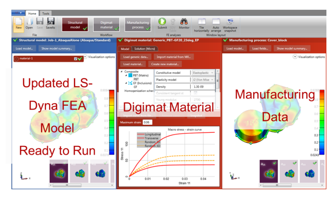
Fig. 3 An efficient and quick tool dedicated to design engineer to set up LS-DYNA FE models with micromechanical material models and taking into account the manufacturing effect on the fiber orientation distribution for an accurate behavior prediction

To complete the answer for design teams, a complete easy to use workflow must be available for the end user which allow to assign the multi-scale material model to the concerned part and to map onto its structural mesh the fiber orientation definition resulting from the process simulation or measurement previously performed on a different mesh.